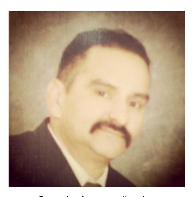
Example of poor quality photo